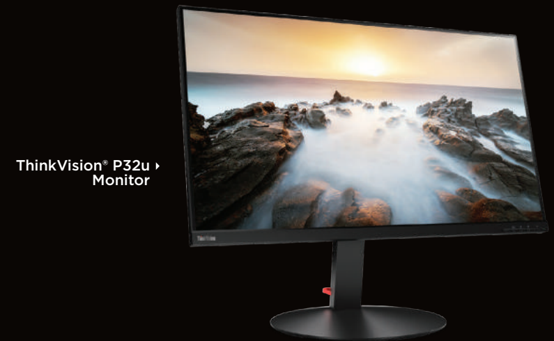
ThinkVision® P32u ▶ Monitor