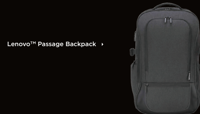
Lenovo™ Passage Backpack ▶